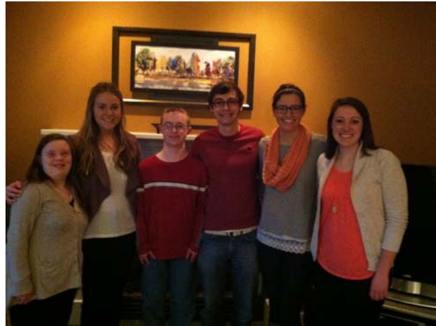
Redbird Readers presenting to CIDSO Board

PO Box 595, Normal, IL 61761 309/452-3264 www.CIDSO.org